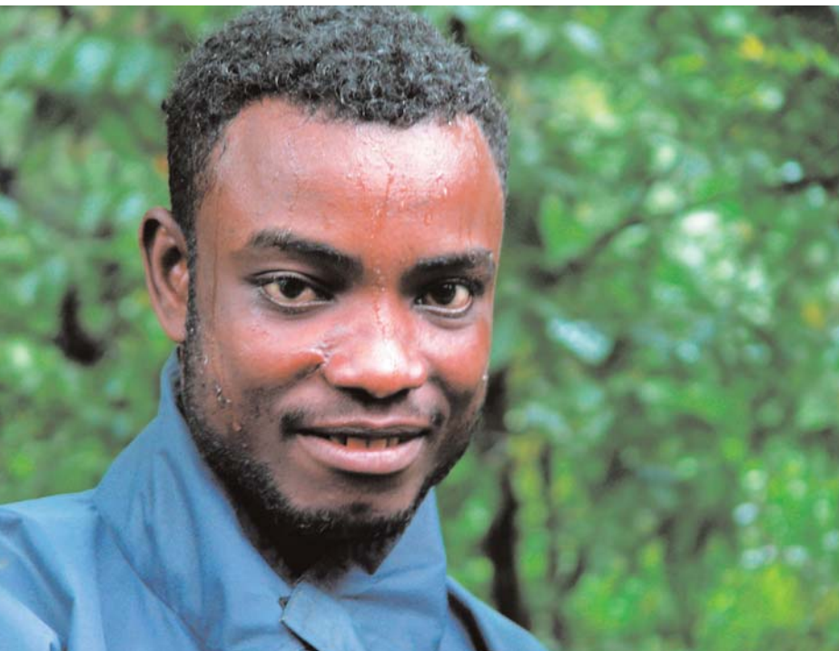
A Siddi mushroom seller

We spot a large number of Kingfishers — white-throated, stork-billed and the little blue ones — all cocking their proud head at others. Then there's the dark knight, the Grey-headed Fishing eagle, standing atop a dead tree trunk in his brown coat, his hunter eyes intent on the water, his plume still as still can be, his claws taut and ready to swoop down the moment unsuspecting fish surface for a random feed. We circumvent a baby crocodile lying on a large rock in the middle of the river, desperately wishing the sun would come out. The seasoned adults know better, they have already gone under. Laxman tells me that the baby can grow up to 12 ft long!